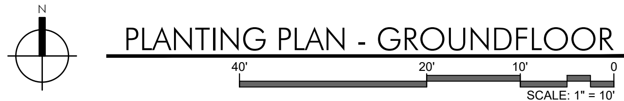
PLANTING PLAN - GROUND FLOOR